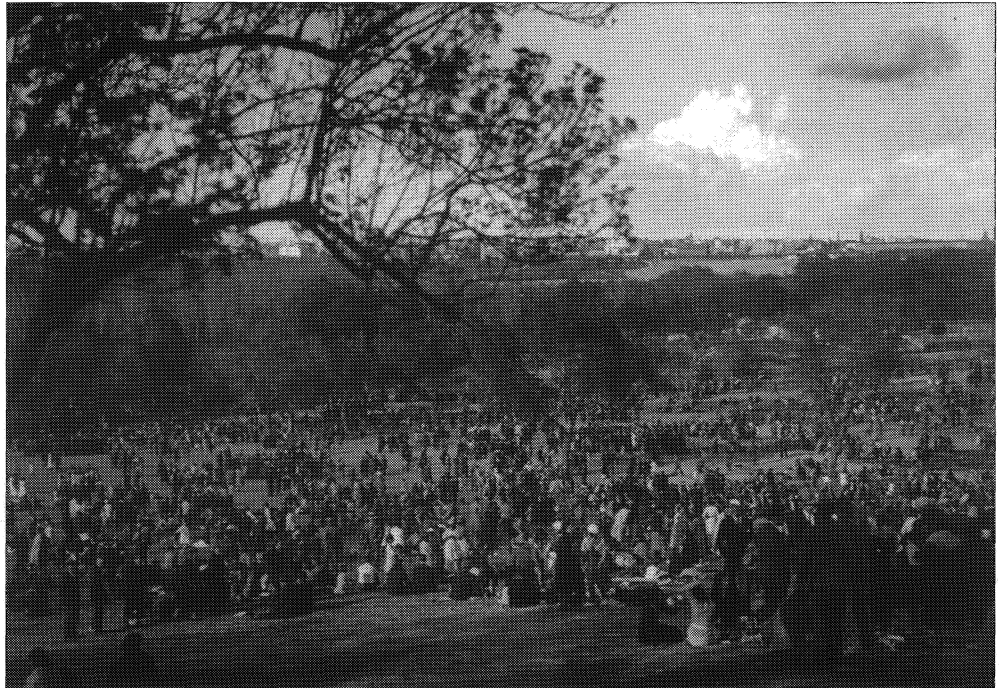
Two photos – workers gather in Madrid, Spain for 1 May 1931 and 1932.