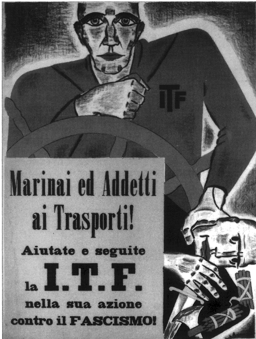
The original of an ITF Italian language poster produced in the 1920s to encourage transport workers to take action against fascism.