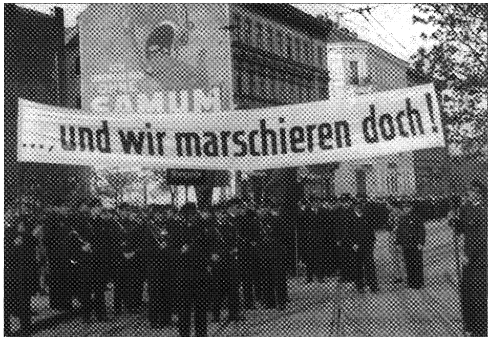
Two photographs depicting May day 1931 in Vienna, Austria.