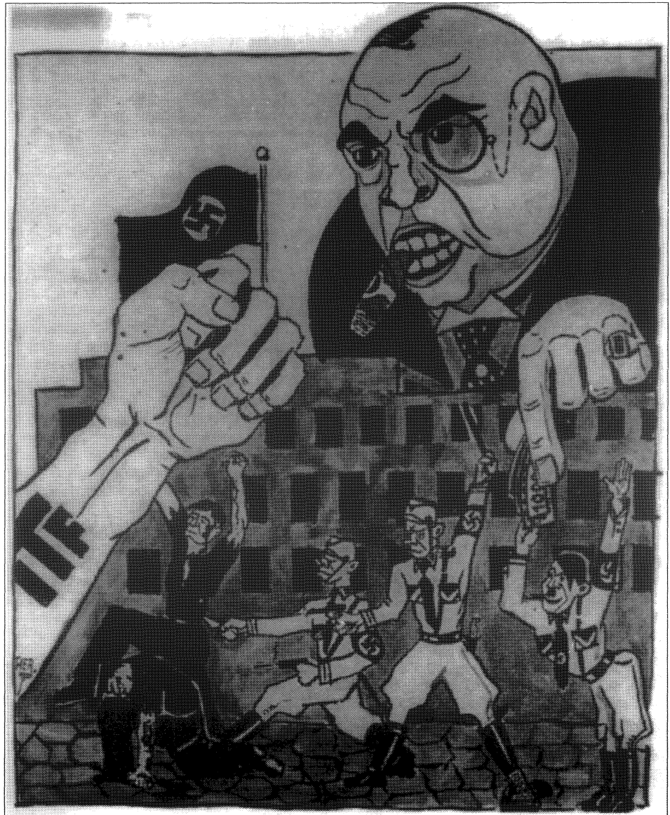
Anti-Hitler graphic produced for ITF anti-Nazi publications that were distributed in the 1930s.