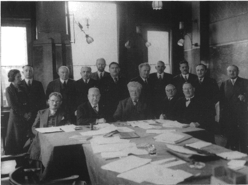
The ITF's General Council and ITF staff meeting in Amsterdam in February 1936.