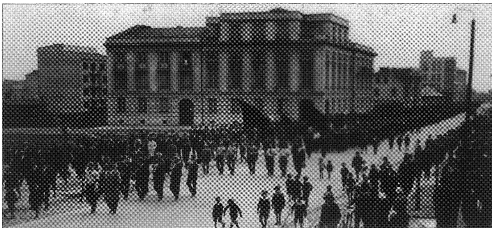
Two photographs depicting May day in Gdynia, Poland in 1932.