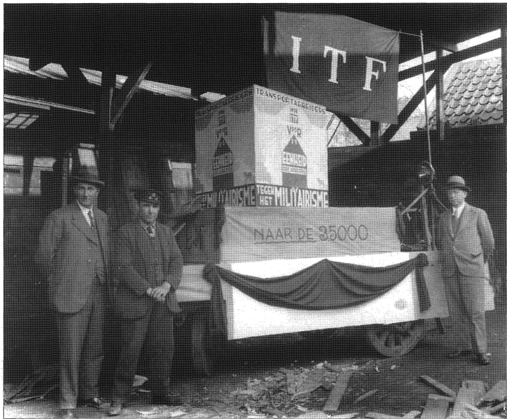
Dutch seafarers in May 1931 in Utrecht.