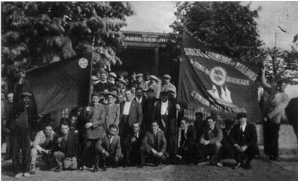
French dockers in Marseilles on 1 May 1931.

In late 1932 the ITF stood on the brink. Within a year the emergence of national socialism and the assault of fascism in Central and Eastern Europe cut deeply into ITF membership – many unions which left the ITF in the 1930s did not return until after 1989. While the ITF and General Secretary Edo Fimmen tried hard to warn European transport workers of the dangers of the growth of fascism, the period following Hitler's seizure of power in Germany in 1933 were dark days for the international labour movement. In 1932 the ITF called upon its affiliated members to provide photographs of national 1 May demonstrations. Reproduced on the following pages are surviving photographs from Austria, Spain, the Netherlands, France and Poland.